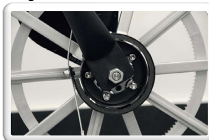
eegoBeltBrake band brake