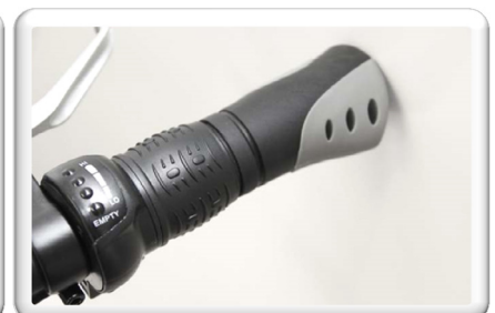
eegoDuoSoft with LED control