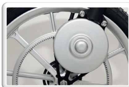
eegoThinCake 120W electro motor

1 year warranty for frame and fork, 6 months for engine, LiION battery, controller and charger.